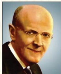
Paul Harris Founder